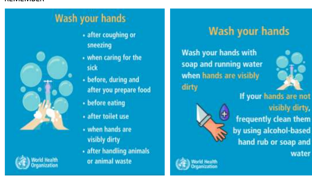
Figure 2: Remember – Wash your hands often