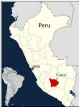
Apurimac is located in the heart of the Andes

This course is designed to expose students to the broad range of anthropologically informed research.